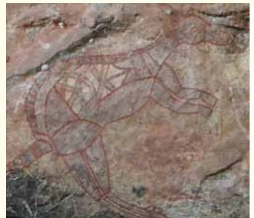
The incredible rock art of Ubirr