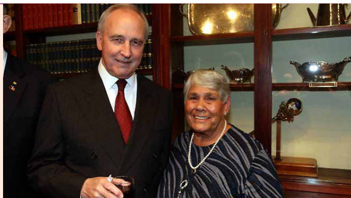
Former Prime Minister Paul Keating with Lowitja O'Donoghue in Adelaide

Mr Keating, whose government passed the Native Title Act in 1993 after historic negotiation with Aboriginal