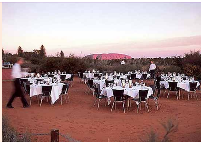
Money-spinner ... dining under the stars at Yulara.