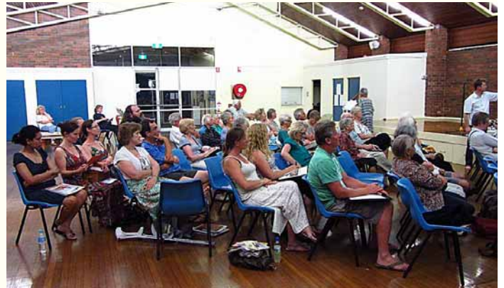
A large attendance at Monday Night's Meeting

The Northern Territory National Emergency Response (also referred to as the Intervention ) was a package of changes to welfare provision, law enforcement, land tenure and other measures, introduced by the Australian Federal Government under John Howard in 2007 to address claims of rampant child sexual abuse and neglect in Northern Territory Aboriginal