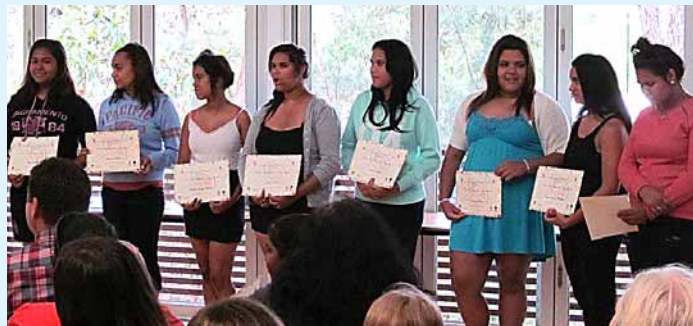
The Biala Girls receive their awards at Brookvale TAFE Saturday morning 12th November