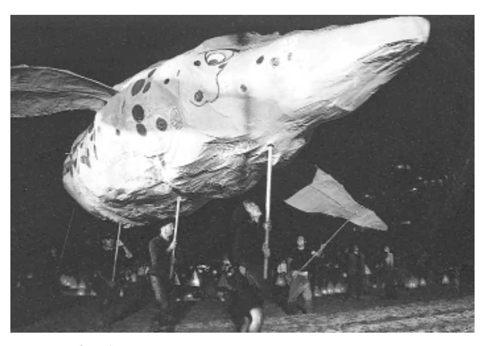
Whale Songlines: The community built the Whale and operated it on the night.