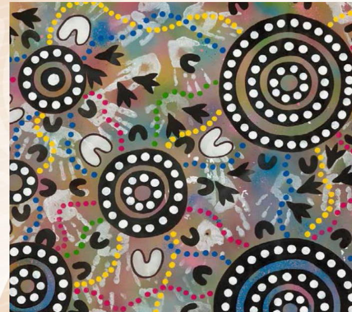
Gerrie Kenton, Story of Place

The festival involves 11 Councils and numerous reconciliation and community groups. Events include workshops, art exhibitions, performances, films and talks.